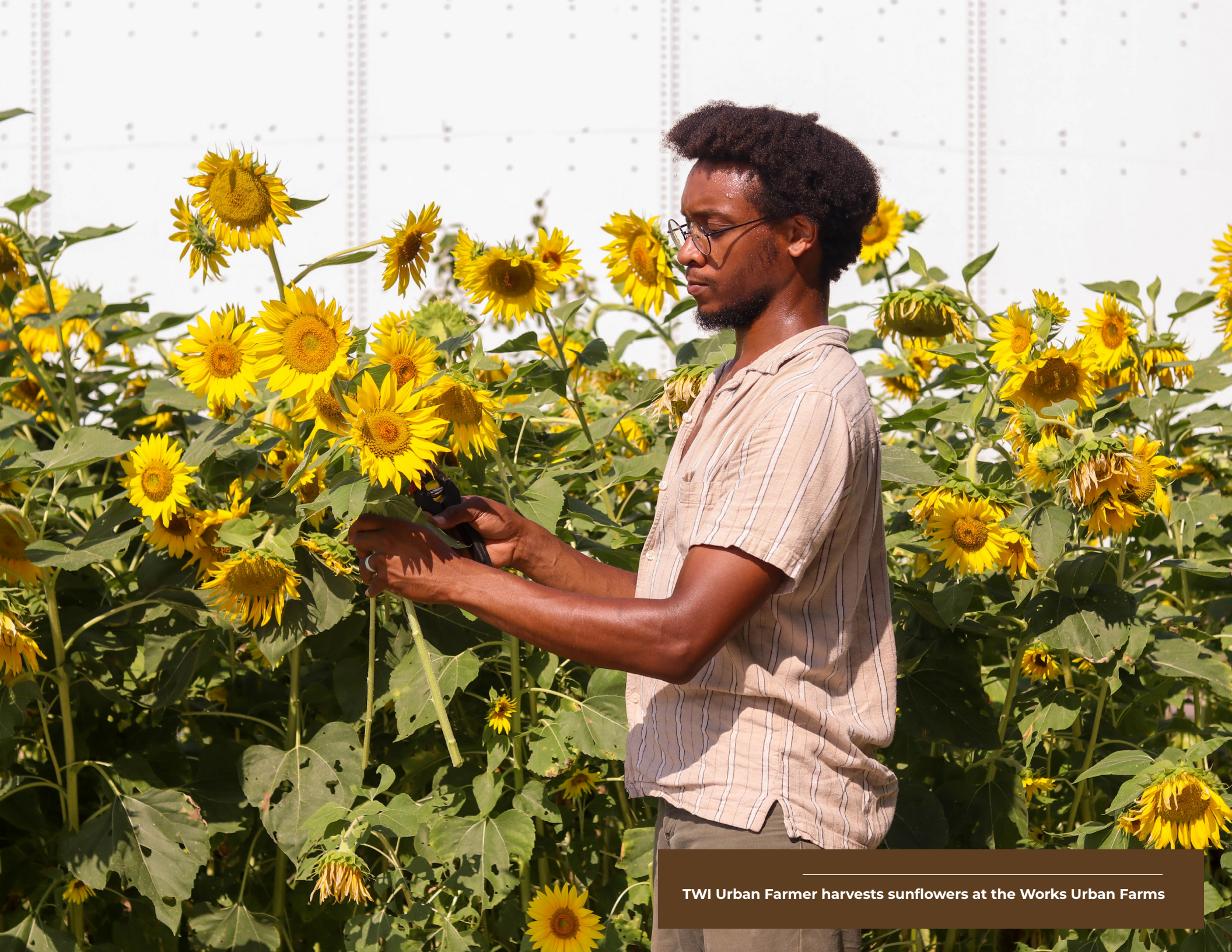
TWI Urban Farmer harvests sunflowers at the Works Urban Farms