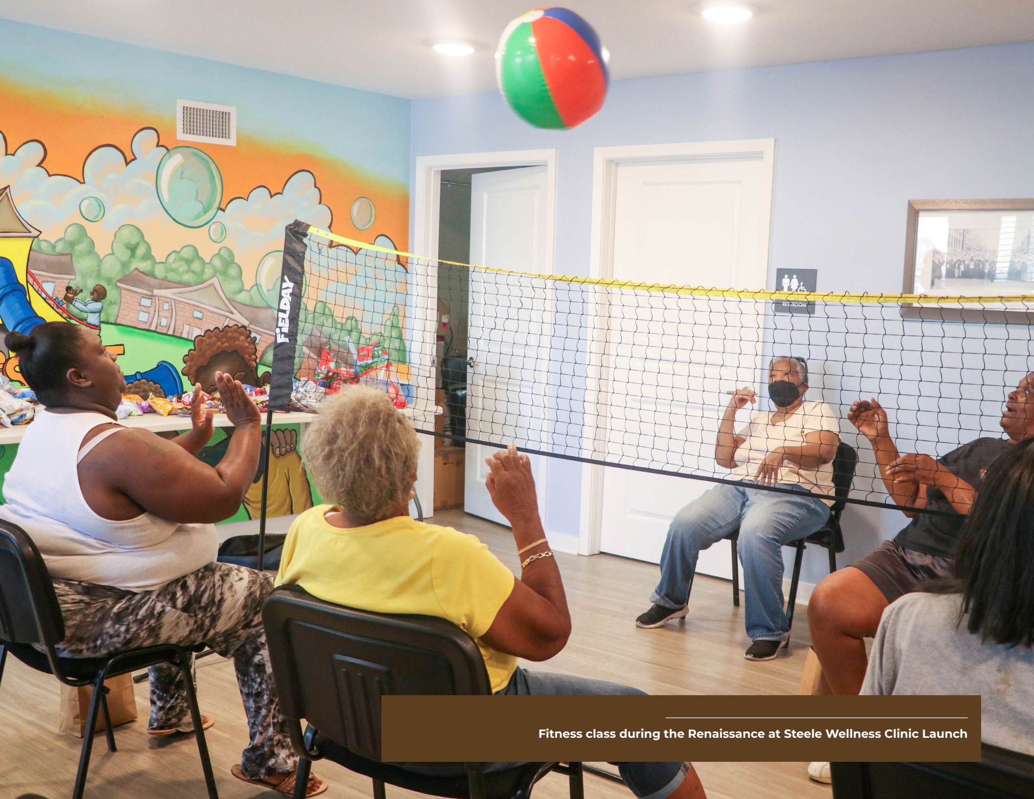
Fitness class during the Renaissance at Steele Wellness Clinic Launch