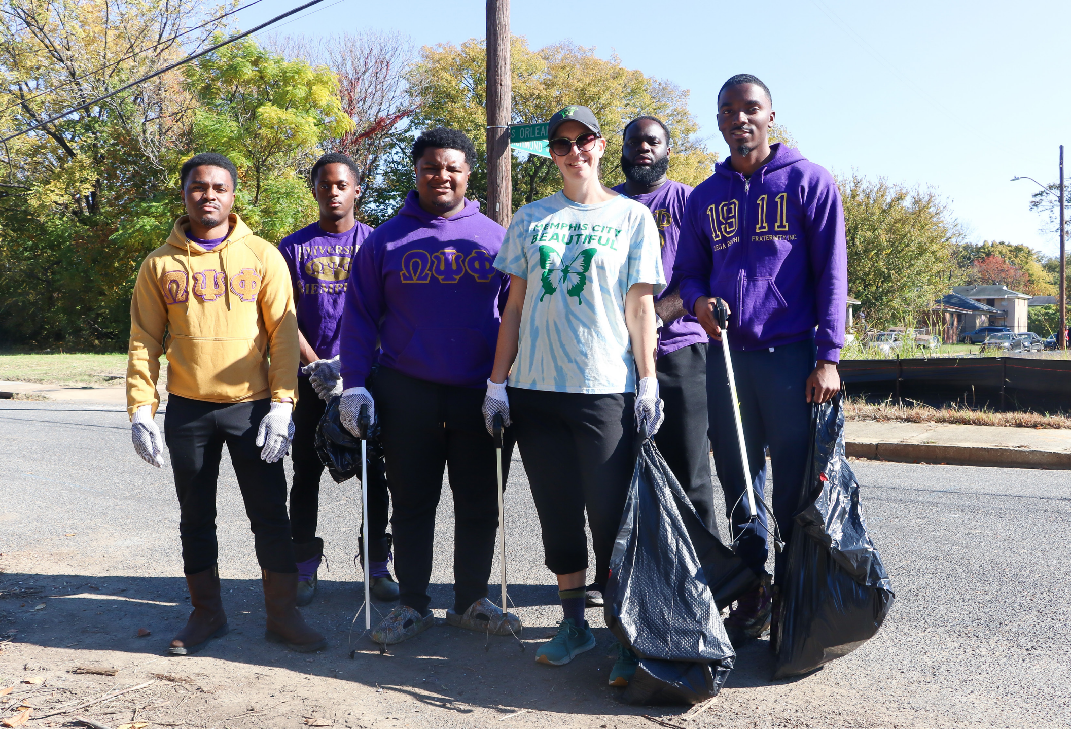
Beautify the Block Community Event Memphis City Beautiful and members of Omega Psi Phi Fraternity during community cleanup